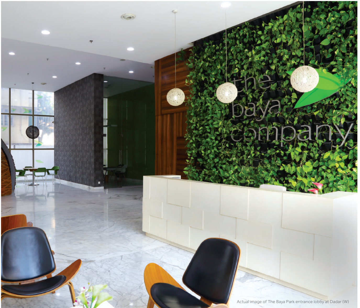
Actual image of The Baya Park entrance lobby at Dadar (W)